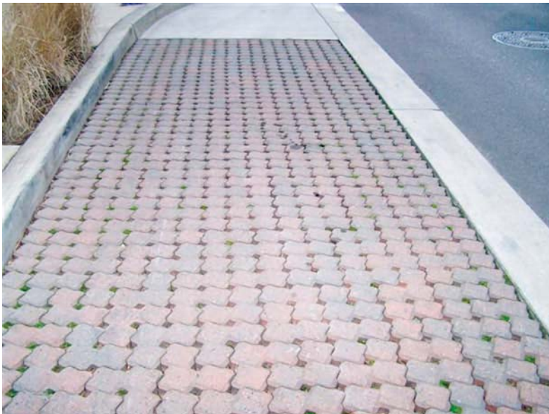
Pervious pavers, note the spaces between the pavers.