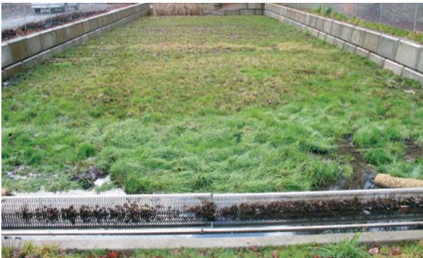
GOOD: A biofiltration swale showing a sediment trap in the foreground.