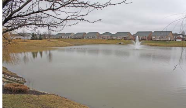
▲ Retention Pond (page 15) is an open basin with a permanent pool of water where sediment and pollutants settle to the bottom.

These facilities typically contain water year-round and often have significant aquatic vegetation. Water levels could rise during a storm, but should not breach the structure.