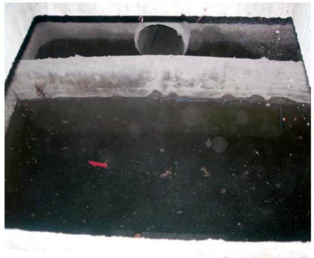
GOOD: A well maintained oil/water separator.