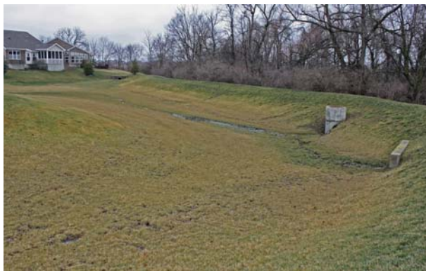
GOOD: Both photos show well maintained detention basins. Shortly after a rain storm, the pool of water, above, is slowly draining. On the left, the basin is dry between storms.

For signs that maintenance is needed, tips on how to fix problems, and general maintenance guidelines, see page 16.