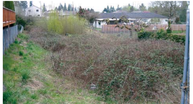
▼ PROBLEM: Noxious weeds have taken over this biofiltration swale.

For signs that maintenance is needed, tips on how to fix problems, and general maintenance guidelines, see the next page.