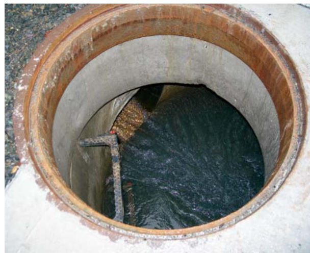
Below: This manhole shows a well maintained interior.

PROBLEM: The photo below shows a catch basin with a lot of sediment built up in it.