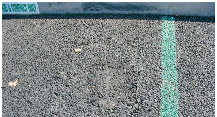
GOOD: Pervious asphalt, note the coarse appearance.