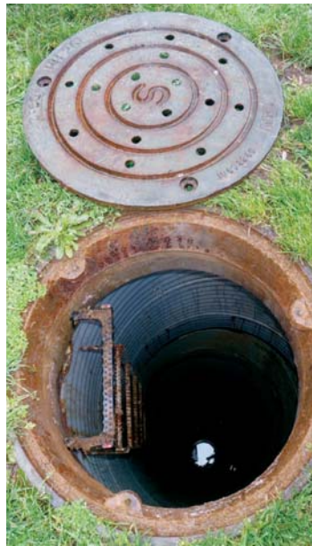
GOOD: Lid and entrance to an underground detention facility.

A closed detention system is an underground structure, typically a concrete vault or series of large diameter pipes, which temporarily stores stormwater and releases it slowly. They typically are used on sites that do not have space for a pond. These underground detention systems are enclosed spaces where harmful chemicals and vapors can accumulate. Therefore, the inspection and maintenance of these facilities can only be done by individuals trained and certified to work in hazardous, confined spaces.