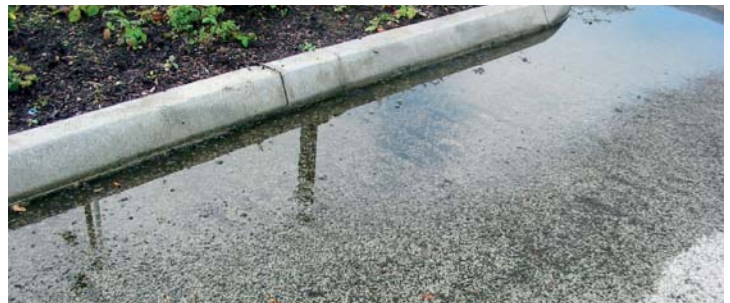
PROBLEM: This pervious concrete needs attention; there should be no standing water.