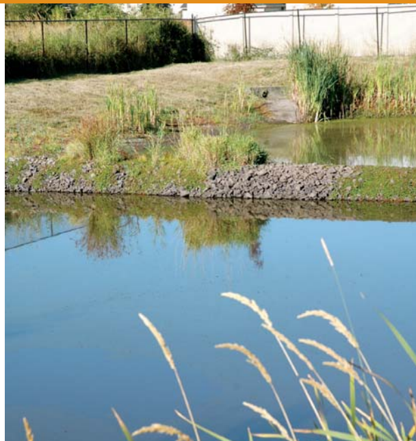
GOOD: Well maintained examples of wetponds. Above shows a two-pool wetpond.

Wetponds also have additional temporary storage above the permanent water level to detain and slowly release stormwater. They may be fenced for safety.