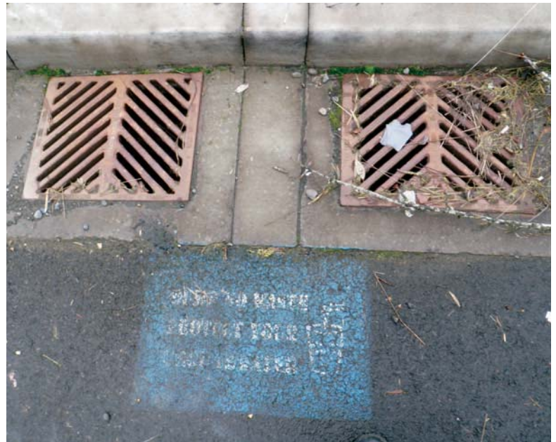
Above: Curb inlet.

Catch basins, curb inlets, and manholes are built into almost all stormwater systems.