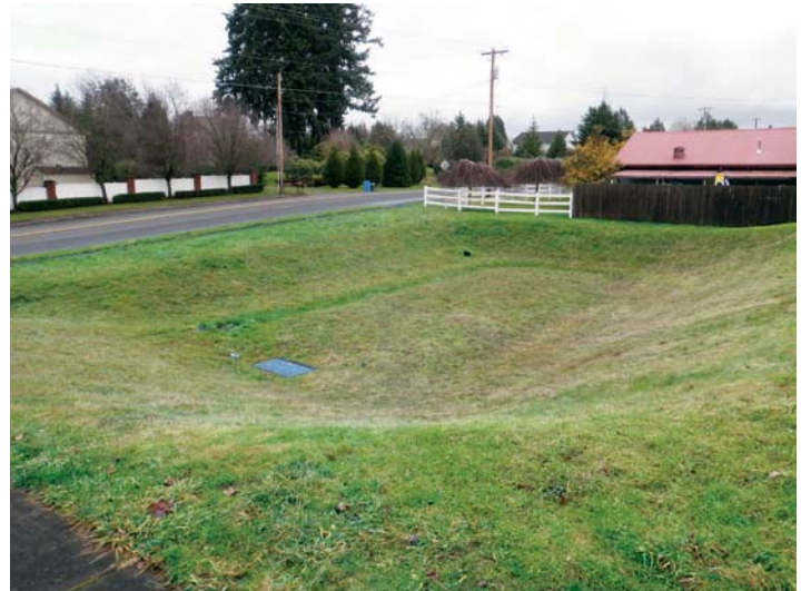
GOOD: Above shows a dry infiltration basin. Unlike a detention basin, an infiltration basin has an underground structure that helps water soak into the ground. Below is a good basin shortly after a rain storm.

A stormwater infiltration basin holds runoff and lets it soak into the ground. The basins are open facilities with grass or sand bases. They can either drain rapidly or act as permanent ponds where water levels rise and fall with stormwater flows. Infiltration facilities can be designed to handle all runoff from a typical storm but could overflow in a larger one. Since the facility is designed to soak water into the ground, anything that can clog the base will reduce performance and be a concern. Generally, infiltration basins are managed like detention basins but with greater emphasis on maintaining the ability to infiltrate stormwater.