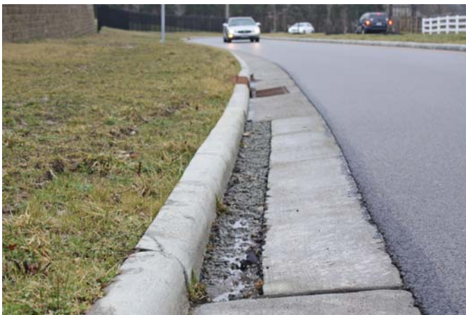
GOOD: Exfiltration trench.