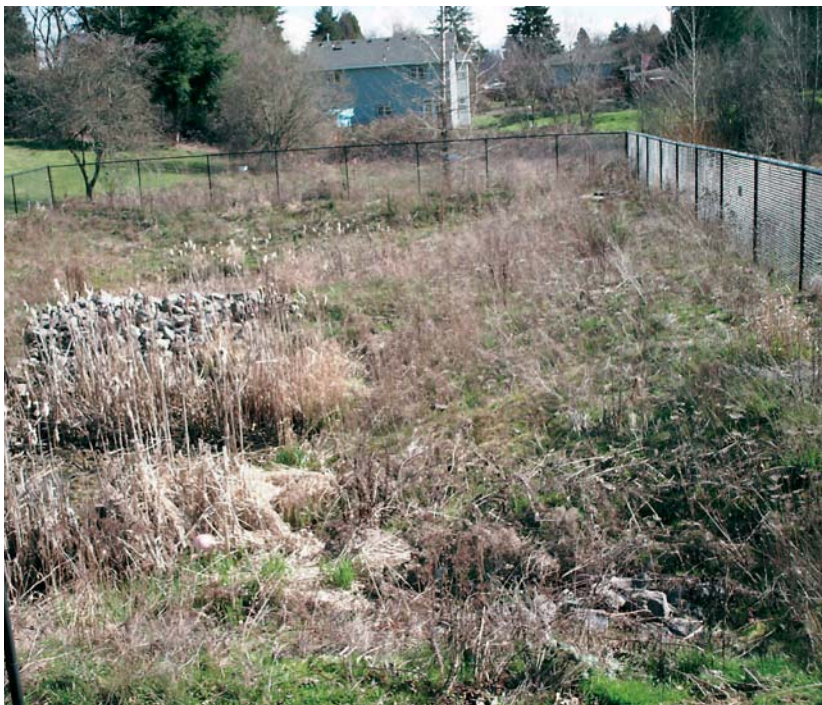
PROBLEM: This detention basin is overgrown with vegetation.