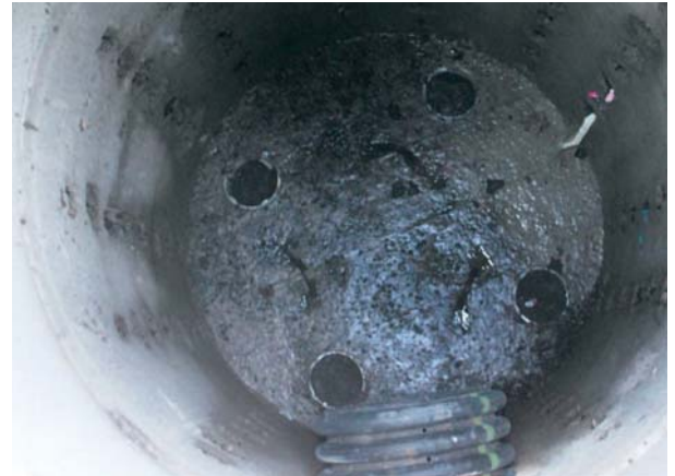
◀▲ GOOD: Left photo shows the typical lid of a drywell. Above is a well maintained interior.