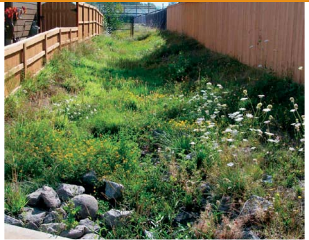
▲ GOOD: Well maintained biofiltration swale.

Biofiltration swales provide treatment for pollution but do not control the amount of stormwater passing through them.