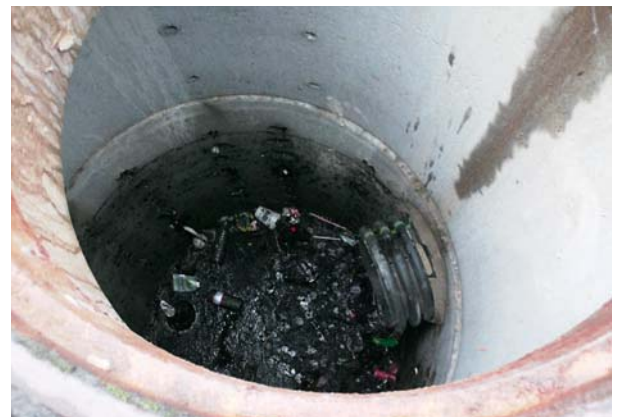
▼ PROBLEM: Trash has collected inside the drywell.